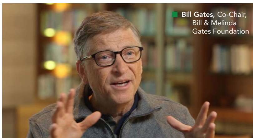
■ Bill Gates, Co-Chair, Bill & Melinda Gates Foundation