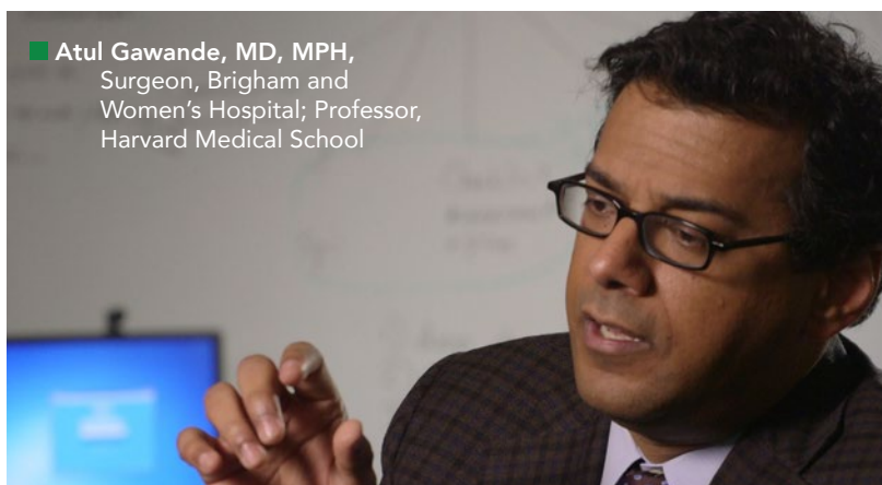
■ Atul Gawande, MD, MPH, Surgeon, Brigham and Women's Hospital; Professor, Harvard Medical School

Another highlight of the day was a video message from Bill Gates, Co-Chair, Bill & Melinda Gates Foundation, who has served as a member of the Center's Advisory Board since its inception in 2012. In addition to the time and effort he has committed, Mr. Gates has also made an initial