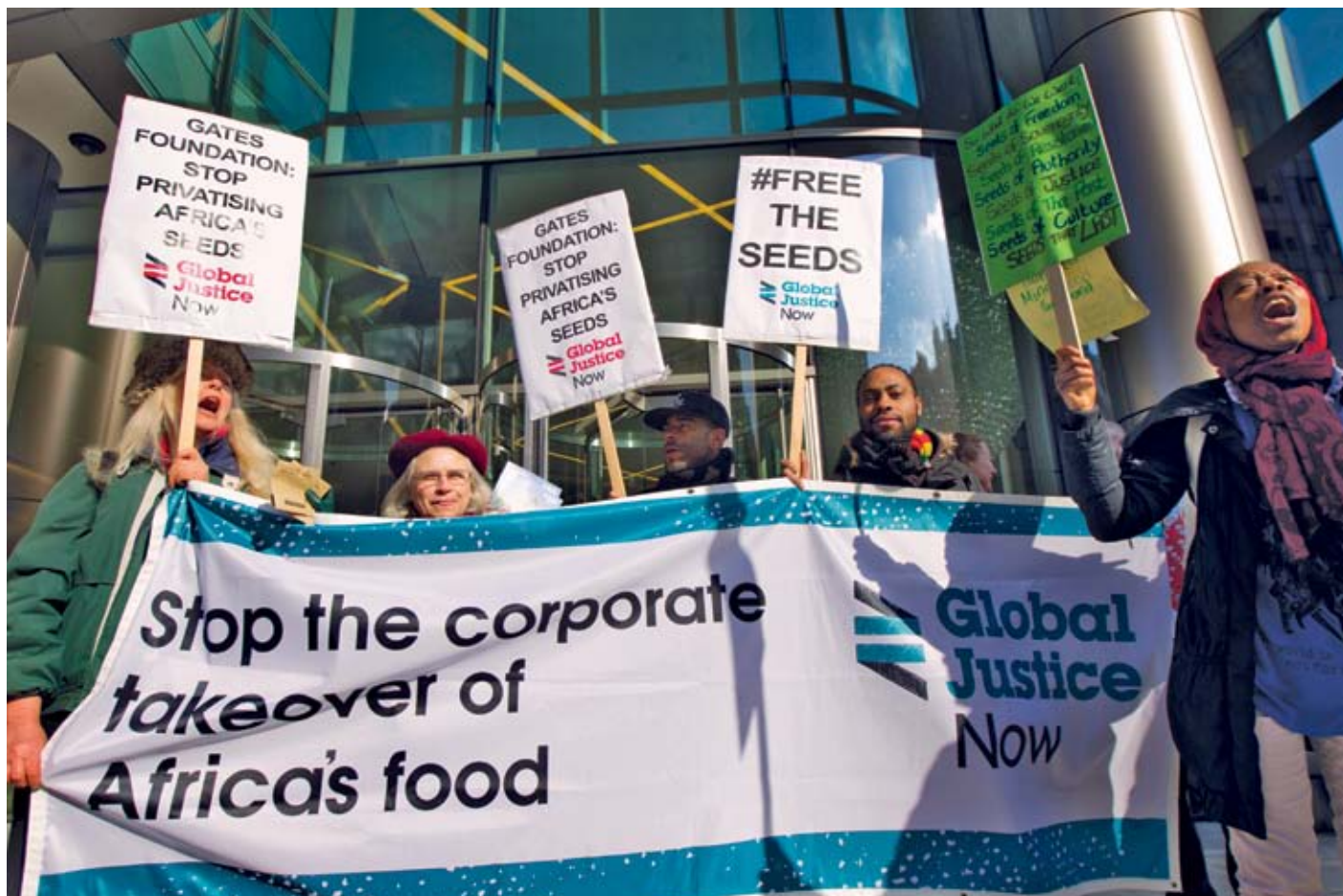
Global Justice Now calls on the BMGF to “Free the Seeds”, March 2015