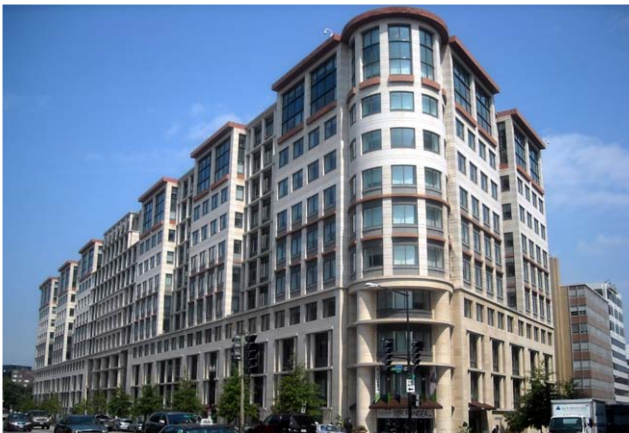
International Finance Corporation headquarters, Washington DC.

Promoting increased private sector interests in Africa can be the only reason why the BMGF is funding the IFC. Yet public-private partnerships in health have often been shown to be disasters. Oxfam's analysis of such a project in Lesotho, in which the IFC was the advisor, found that a hospital being built in the programme was consuming more than half of Lesotho's health budget, leaving few resources for tackling serious health problems in one of the world's poorest countries. Oxfam called on the IFC to halt its advisory work on health public-private partnerships until and unless the case has been fully and independently investigated. 238