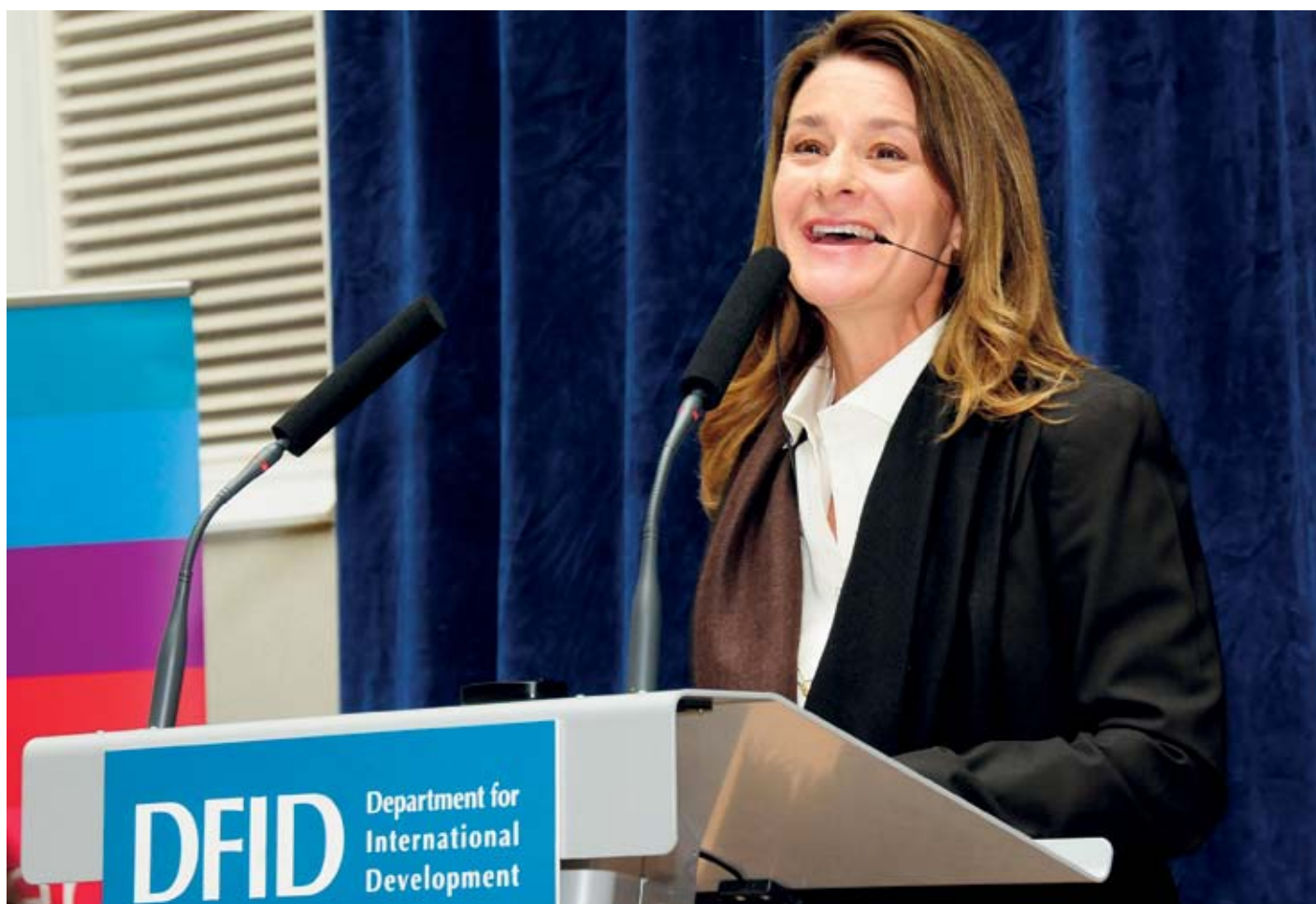
Melinda Gates addresses the UK's Department for International Development in 2010.

HANSHEP's CHMI programme is being implemented by the Results for Development (R4D) Institute, also funded by the BMGF, which also promotes private sector involvement in basic services. 231 R4D's Board members include Carla Hills, the former US Trade Secretary who currently serves on the international boards of JP Morgan Chase and Rolls Royce. 232