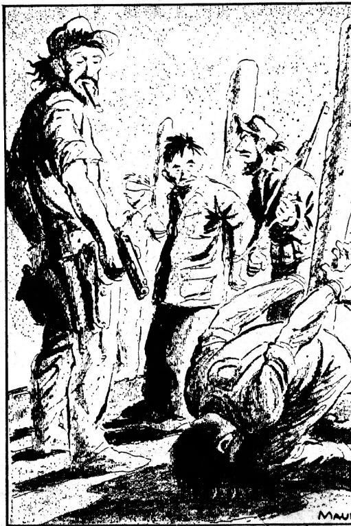
Mauldin—St. Louis Post-Dispatch "THINK WHAT COULD HAPPEN TO YOU IF WE WEREN'T IDEALISTS!"