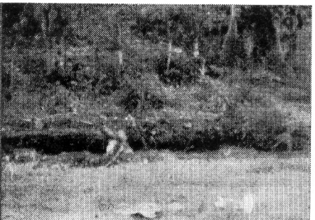
Canal 12, Escuela de Television