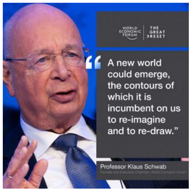
Klaus Schwab, ex-Bilderberg Steering Committee

The <u>Great Reset</u> is an <u>SDS</u> attempt to reframe of economic inequality in a positive light: "You'll own nothing, and you'll be happy". COVID-19 has greatly increased economic inequality as small and medium enterprise have been forced under while unprecedented peacetime increases in the money supply and corporate welfare have been doled out to a few large organisations.