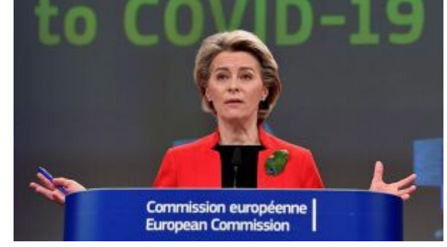
Ursula von der Leyen, a figure of great importance in COVID-19 event