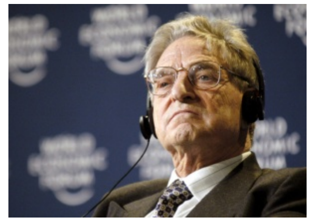
George Soros, of The Good Club, is suspected to have been controlling the narrative through groups such as BLM