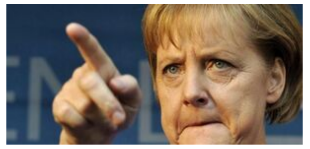
Angela Merkel as German Chancellor stated that "the pandemic is not over until all people in the world have been vaccinated"