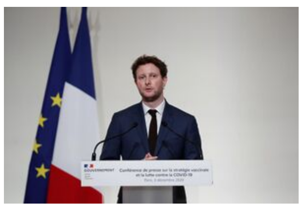
Clément Beaune announcing the vaccine strategy

Jens Spahn was made German Health minister after attending the 2017 Bilderberg, rejected a donation of hydroxychloroquine in 2020<sup>[90]</sup> and stated that "vaccines are the way out of this pandemic"