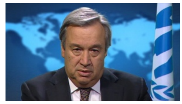
"I urge world leaders to fully support the Global Vaccination Strategy I launched with the World Health Organization last month. We need to get vaccines into the arms of 40 per cent of people in all countries by the end of this year [2021] — and 70 per cent by mid-2022."