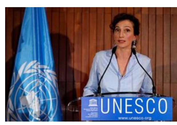
Audrey Azoulay, UNESCO Director general, "Every day, people are searching for a path out of the COVID-19 pandemic. Now, scientific international cooperation and vaccines have created hope that a brighter future is within reach..."<sup>[88]</sup>

Sidelining of <u>drugs</u> to treat the disease was a requirement for the granting of Emergency Use Authorisation of the experimental jabs. Many Bilderberg controlled groups, such as